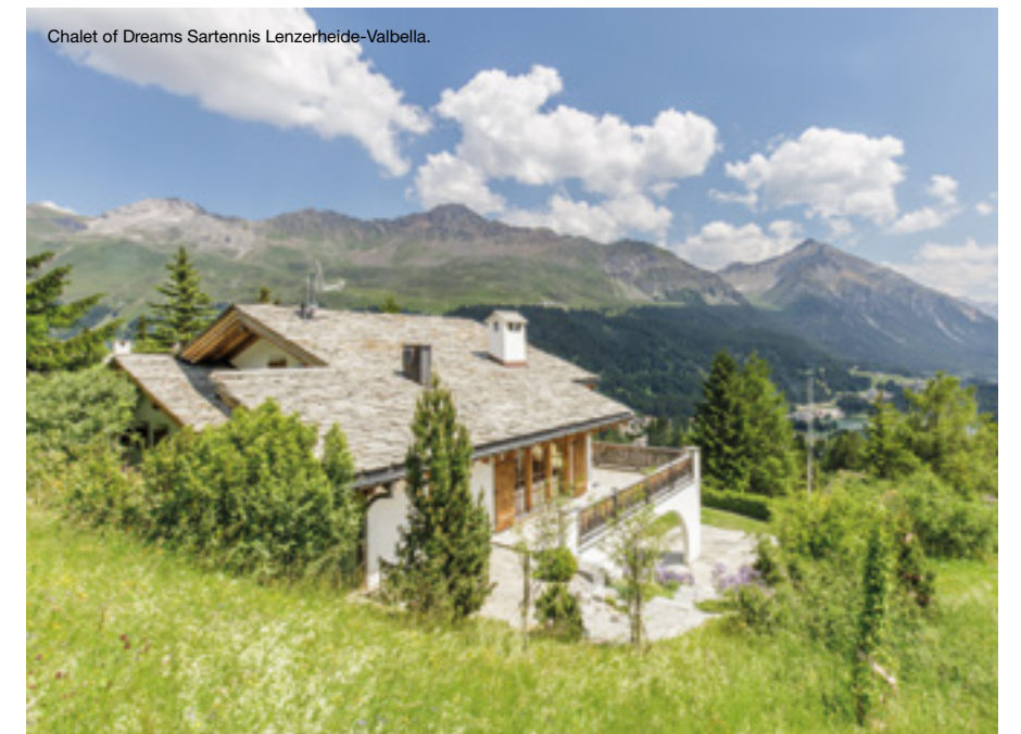
Chalet of Dreams Sartennis Lenzerheide-Valbella.