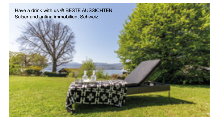
Have a drink with us @ BESTE AUSSICHTEN! Sulser und an fina immobilien, Schweiz.