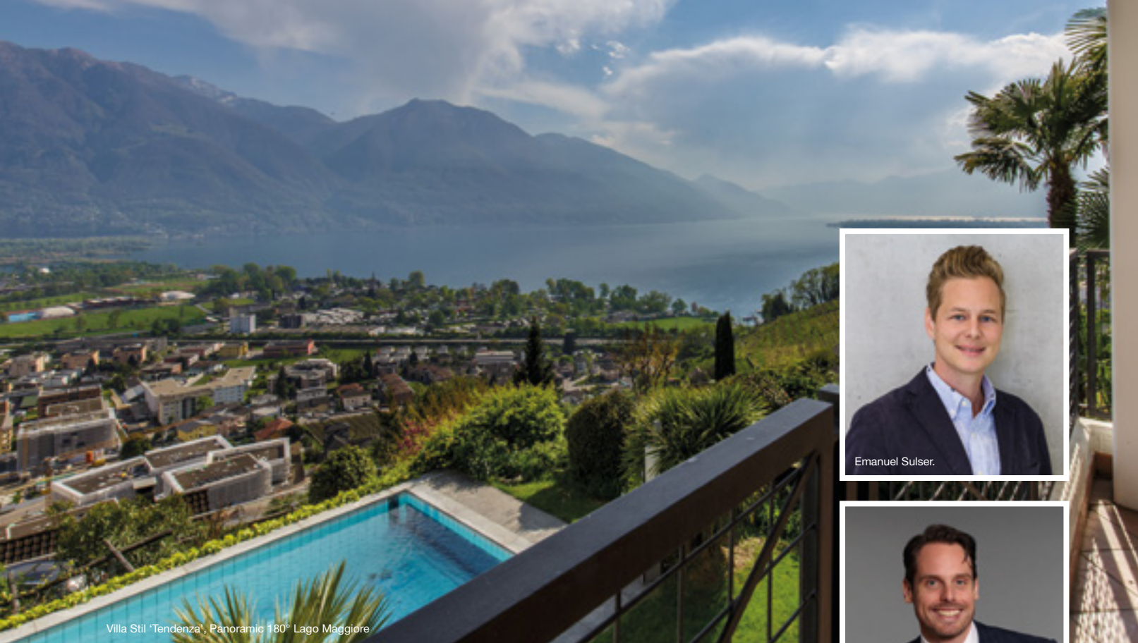
Villa Stil 'Tendenza', Panoramic 180° Lago Maggiore