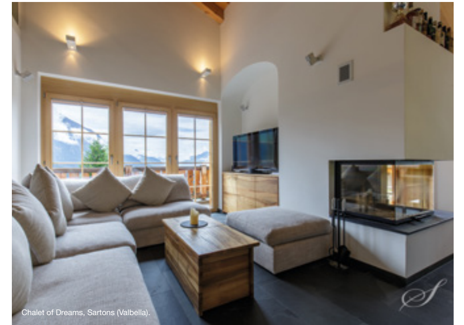
Chalet of Dreams, Sartons (Valbella).